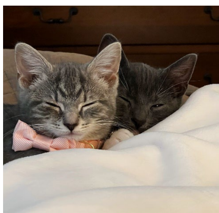
Elvis & Priscilla